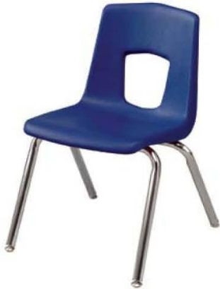
NO. L212 STACK LIBRARY CHAIR 17-1/2" NO. L213 STACK LIBRARY CHAIR 15-1/2" Chair shell is durable polypropylene available in a variety of colors. Leg base is tubular steel with a black powder coat finish.