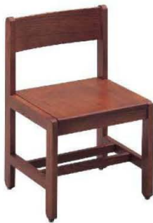
NO. L215 LIBRARY CHAIR WOOD SEAT #80 SERIES NO. L216 LIBRARY CHAIR UPHOLSTERED SEAT. Library chair is oak wood construction. When upholstered seat is specified there is a variety of grades and colors to choose from . Jasper #80 series Heights are 17-1/2' and 15-1/2"