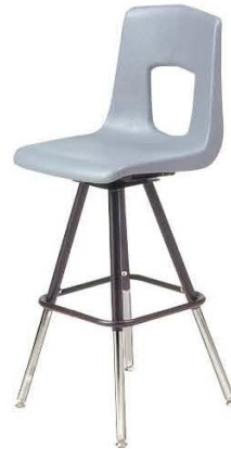
NO. L214 LIBRARY STOOL STOOL shell is durable polypropylene available in a variety of colors. Leg base is tubular steel with a black powder coat finish.