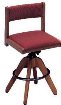
NO. L219 LIBRARY STOOL WOOD SEAT #80 SERIES NO. L220 LIBRARY STOOL UPHOLSTERED SEAT. Library chair is oak wood construction. When upholstered seat is specified there is a variety of grades and colors to choose from . Jasper #80 series