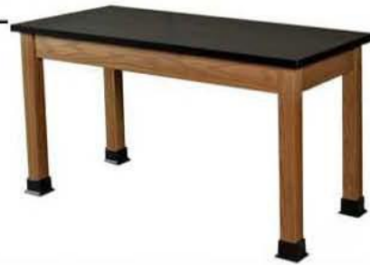
Table top will be 1 1/4" thick high pressure laminate with black P.V.C. banded edges. Top will be reinforced by 4" wide x 13/16" thick solid oak aprons running between the legs. Legs will be 2 1/4" square glued up solid oak with adjustable glides. Legs will be attached to aprons with lag bolts and heavy duty steel corner braces. Standard table height is 30", other heights may be specified. We recommend that the table be 11" higher than the chair that will be used.