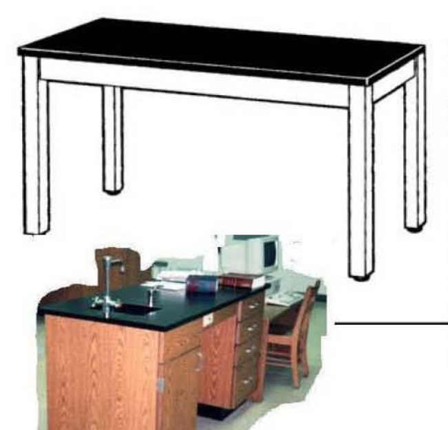
Table top will be 1 1/4" thick high pressure laminate unless otherwise specified. Top will be reinforced by 4" wide x 13/16* thick solid oak aprons running between the legs. Legs will be 2 1/4" square glued up solid oak with acid-resistant shoes. Legs will be attached to aprons with lag bolts and heavy duty steel corner braces. Standard table height is 30", other heights may be specified. We recommend that the table be 11" higher than the chair that will be used.