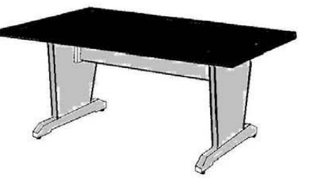
NO. $454-$056 PEDESTAL TABLE 72"L. X 36. X 30"H. NO. $455-$058 PEDESTAL TABLE 72"L. X 42"W. X 30"H.

Table tops will be 1-1/8" thick black High Pressure Laminate with black p.v.c. edges unless otherwise specified. Tops will be reinforced by 4" wide x 13/16" thick solid oak aprons running between the legs. Book compartment and drawer tables will have 5" wide aprons. Legs will be 2-1/4" square glued up solid oak with adjustable glides and black acid resistant shoes. Legs will be attached to aprons with lag bolts and heavy duty steel corner braces. Standard table height is 30".