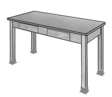
NO. $449-$038-24 BOOK COMP. TABLE 54"L. X 24"W. X 30"H. NO. $450-$039-24 BOOK COMP. TABLE 60"L. X 24"W. X 30"H.